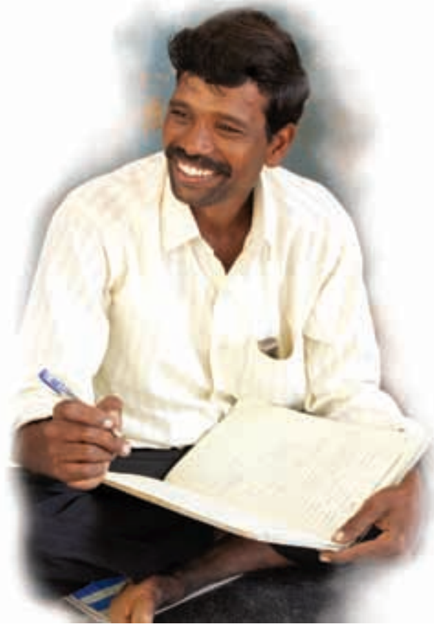
Villagers are trained to maintain their own records